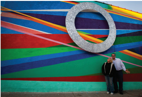
2014: "Spectrum," by Cathy Smithey