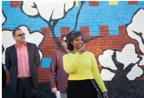
2015: "High Cotton," by Pamela Edwards